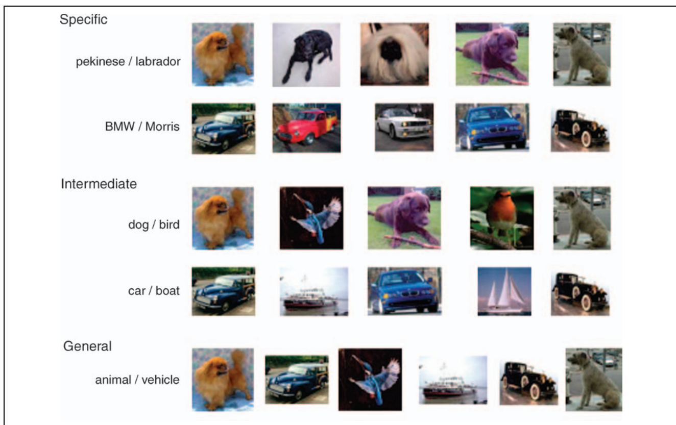
Figure 3. Examples of some of the stimuli used in the experiment. In the specific condition, all items within a scan were from the same category (e.g., different kinds of dogs, different kinds of car, etc.). In the intermediate condition, all items were from the same semantic domain (e.g., all animals or all vehicles). In the general condition, items from both domains were intermixed.

were used for the category labels: specific (e.g., Labrador, BMW), intermediate (e.g., dog, car) and general (e.g., animal, vehicle). Exactly the same set of 48 photographs were viewed in all three task conditions. Half of the trials were target trials, in which the photograph matched the word, and half were distracter trials. For specific trials, distracters were drawn from the same semantic category as the probe word (e.g., if the probe was “Labrador,” the distracter was always a different breed of dog). For intermediate trials, the distracter was from a different category in the same superordinate domain (e.g., if the probe was “dog,” the distracter was always a different kind of animal); for general-level trials, the distracter was always from the contrasting semantic domain (e.g., if the target was “animal,” the distracter was always a vehicle).